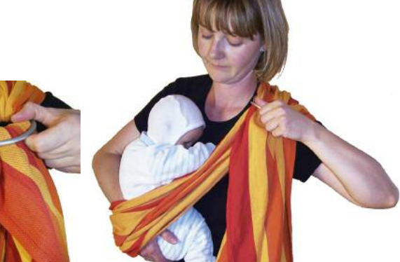
To loosen the Storchenwiege® RingSling, lift your child up a little and twist up the upper ring. This automatically loosens the pouch. Your free hand supports the child. Once you have loosened the Storchenwiege® RingSling in this way, you can reach into the pouch and lift out the child.