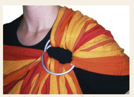
After the sling is put on firmly

The following pictures show ring positions which mainly make the sling uncomfortable, but also stop it from being put on properly and pulled tight.