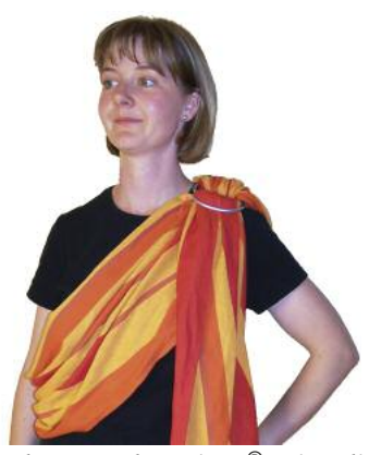
The Storchenwiege® RingSling is draped over one shoulder like a sash, with the rings on the shoulder.