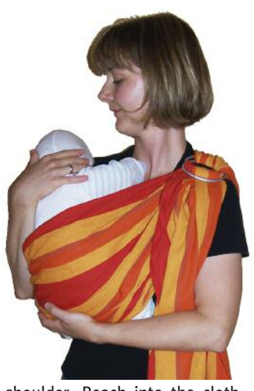
1. Place the child against your uncovered shoulder. Reach into the cloth pouch from below with your free hand. The child will now slide down from your shoulder into the pouch, supported by your free hand.