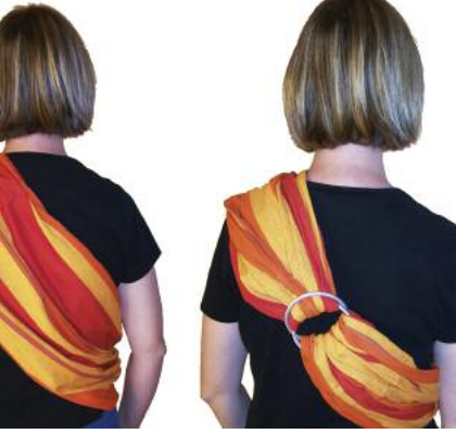
When carrying the baby on your back, when you first put on the sling, the rings are in the middle of your back.