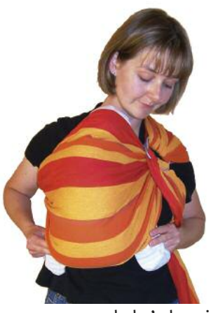
When pulling your Storchenwiege® RingSling tight, lift your child up slightly.

4. Now move your baby's legs into the right "frog" position, which is absolutely necessary for the healthy development of the hips and to keep her back rounded. Rule of thumb: the child's knees are about level with her belly button.