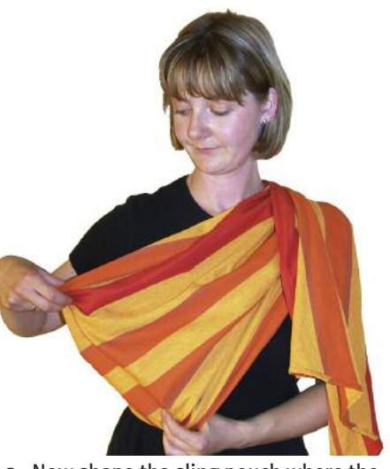
2. Now shape the sling pouch where the child will snuggle up to you. The lower edge of the sling is at waist height, and the upper edge above the chest, level with the collar bone.