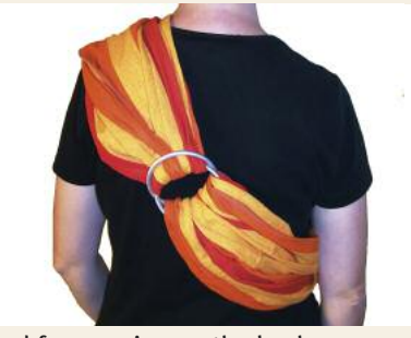
and for carrying on the back