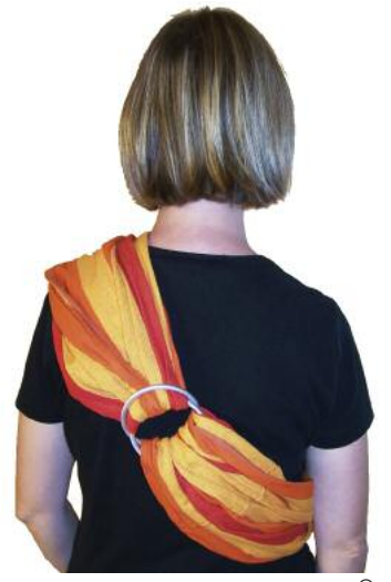
1. Put on the Storchenwiege<sup>®</sup> RingSling like a sash. The ring is in the middle of your back.

Suitable for children who can hold up their heads alone and have good control over their upper body.