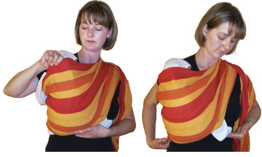
4. Next, pull the upper edge of the sling over your baby's back. There must be almost no creases in the material across your child's back, so when smoothing it out, tuck the remaining material under baby's bottom.