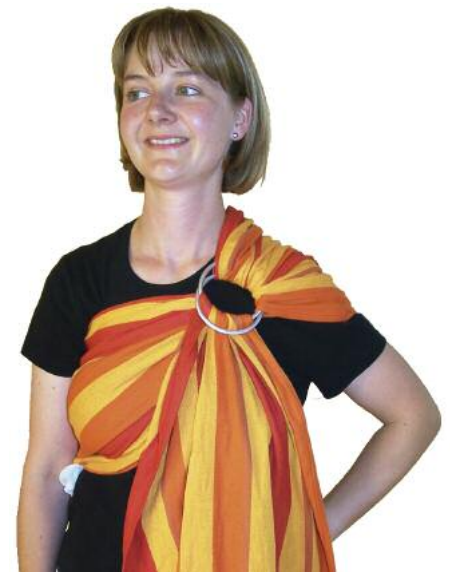
After the sling is carefully pulled tight, the rings are in their usual position, level with your collarbone. The length of material runs across your chest.