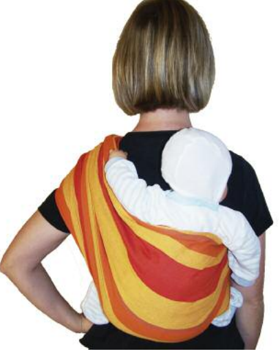
The child is in a squatting "frog" position on your back. Correct her position by carefully lifting her legs up a little.