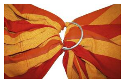
All the material is now pulled back through one ring.