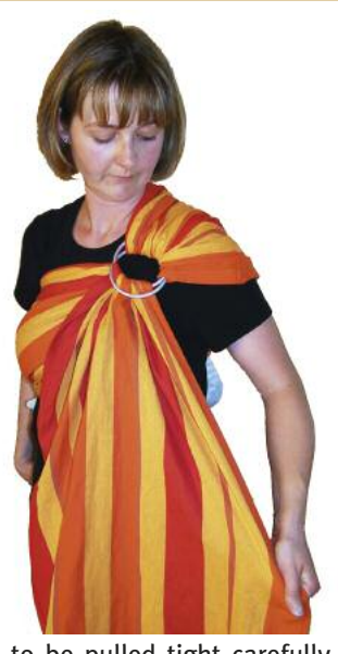
6. The Storchenwiege<sup>®</sup> RingSling now needs to be pulled tight carefully, to provide optimal support for the child and also make it comfortable to wear. Bend slightly forwards and lift the child up slightly on your back with your hand. Start pulling the sling tight with the upper edge which runs under your arm, grasping the material every 5–10 cm and working down to the lower edge.