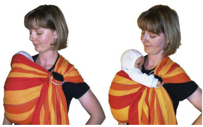
In this carrying position, the child is in a tummy-to-tummy squatting position at waist height. Larger children like to have their arms outside the sling.

4. Now move your baby's legs into the right "frog" position, which is absolutely necessary for the healthy development of the hips and to keep her back rounded. Rule of thumb: the child's knees are about level with her belly button.