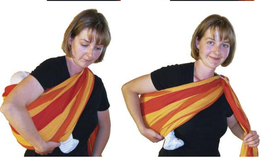
5. Now push the child under your arm onto your back. This is easier if you wriggle a little yourself.