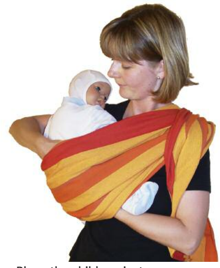
3. Place the child against your uncovered shoulder. Reach into the cloth pouch from below with your free hand. The child will now slide down from your shoulder into the pouch, supported by your free hand.