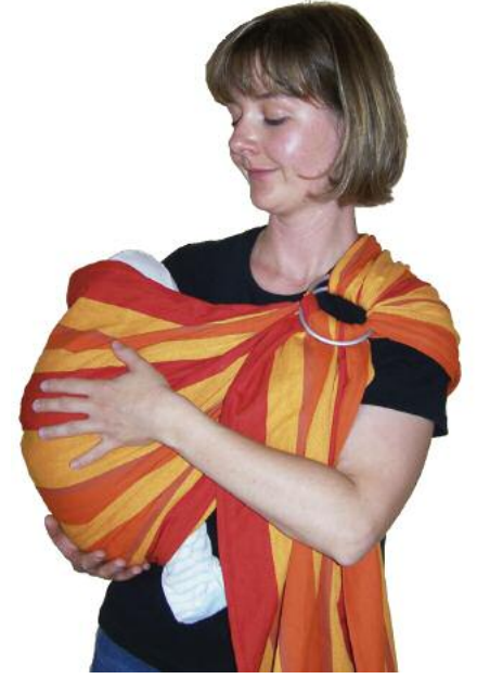
3. Now, push your child to one side with one hand until she is on your hip. Your other hand supports her. When you do this, make sure the rings do not slide too far towards the middle of your body.