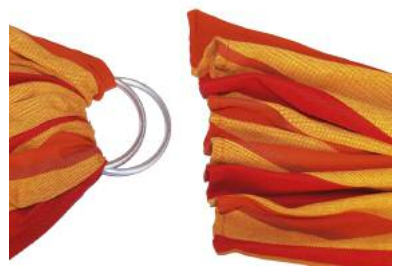
Closely fold the material at the end Now pull the folded material through with no rings into pleats (like a concertina).

The following steps are the same for all the carrying methods shown.