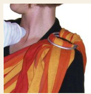
Position when putting in the baby, when worn tummy-to-tummy and on the hip

For comfortable wearing, it is especially important that the rings are in the right position, so when you put on the Storchenwiege® RingSling, make sure the rings are on your shoulder (when worn tummy-to-tummy or on the hip) or in the middle of your back (when worn on the back), when you put the child in. If the sling is carefully pulled tight and the child is in the proper "frog" position, the rings are about level with the collarbone. The material is fanned out over the shoulder.