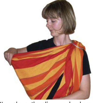
Now shape the sling pouch where the child will snuggle up to you. The lower edge of the sling is at waist height, and the upper edge above the chest, level with the collar bone. The rings are still on your shoulder or in the middle of your back.