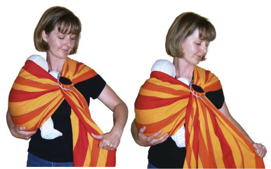
4. The Storchenwiege<sup>®</sup> RingSling now needs to be pulled tight carefully, section by section, to provide optimal support for the child and also make the sling comfortable to wear. Start with the edge at the head end, grasping the material every 5–10 cm and working down to the lower edge.

When pulling your Storchenwiege® RingSling tight, lift your child up slightly.