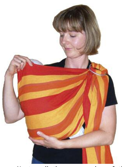
2. Next, pull the upper edge of the sling over your baby's back up to her head, about two finger-widths above her ears. With bigger children, who can easily hold their heads up alone, the lower edge of the sling can be lower down. There must be almost no creases in the material across your baby's back, so, when smoothing it out, tuck the remaining material under baby's bottom.